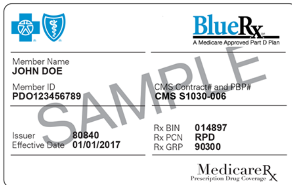
Front of card