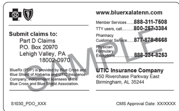
Back of card

Please carry your card with you at all times and remember to show your card when you get covered drugs. If your plan membership card is damaged, lost, or stolen, call Member Services right away and we will send you a new card.